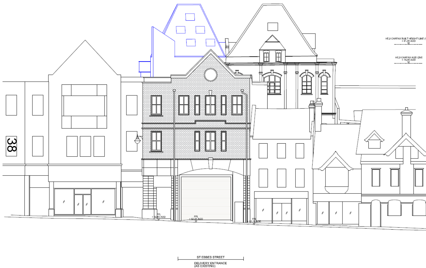
Proposed St Ebbes Elevation