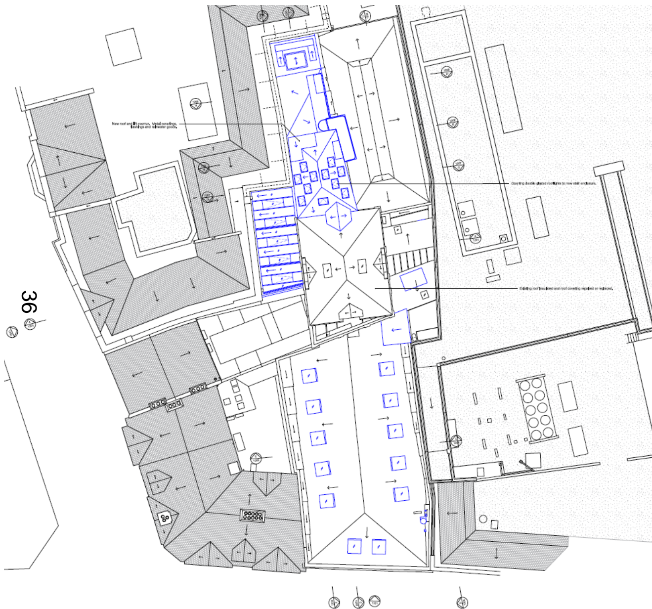
Proposed Roof Plan