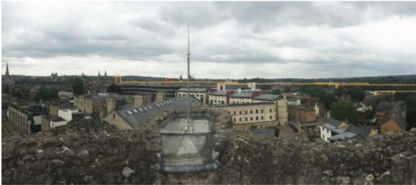
40 Panoramic view from St George's Tower, highlighting Modern Art Oxford (red), the Westgate Development (orange) and the extension to the Story Museum (yellow).