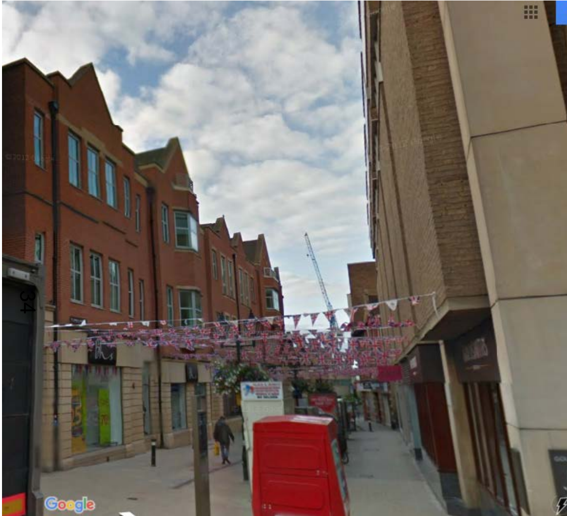
View down St Ebbes Street