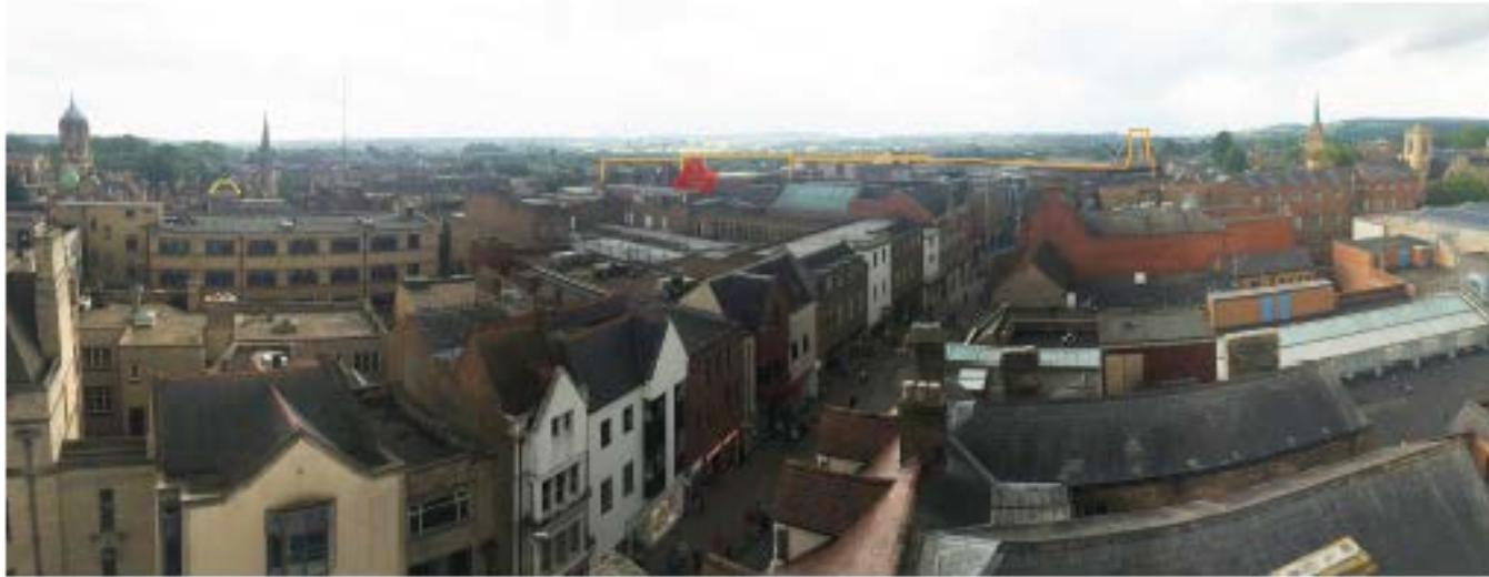
Panoramic view from Carfax Tower, highlighting Modern Art Oxford (red), the Westgate Development (orange), and the extension to the Story Museum (yellow).