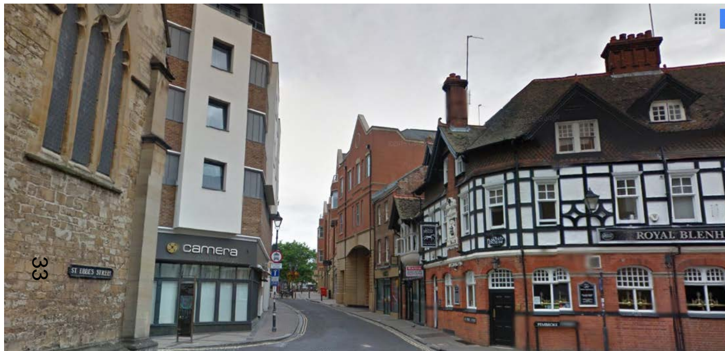
View up St Ebbes Street