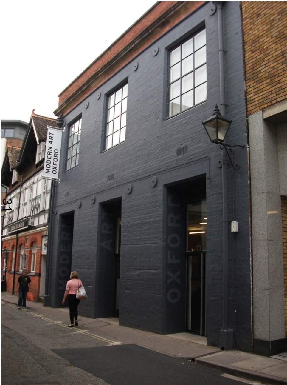
Main Entrance on Pembroke Street